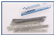
Mold Polishing Stones