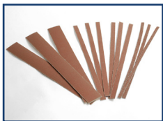
Aluminum Oxide PSA Strips