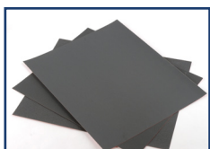
Silicon Carbide Paper