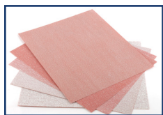
Aluminum Oxide Paper